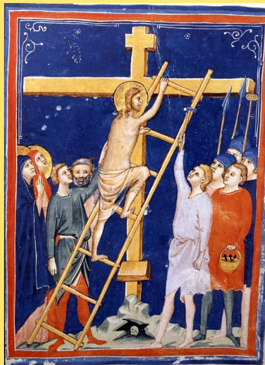
"Christ Mounting the Cross" by Pacino di Bonaguida

Facebook: www.facebook.com/StMarysCoonValley