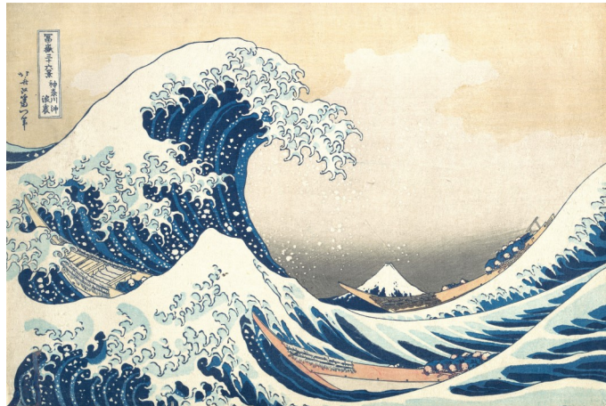
"The Great Wave off Kanagawa" by Katsushika Hokusai